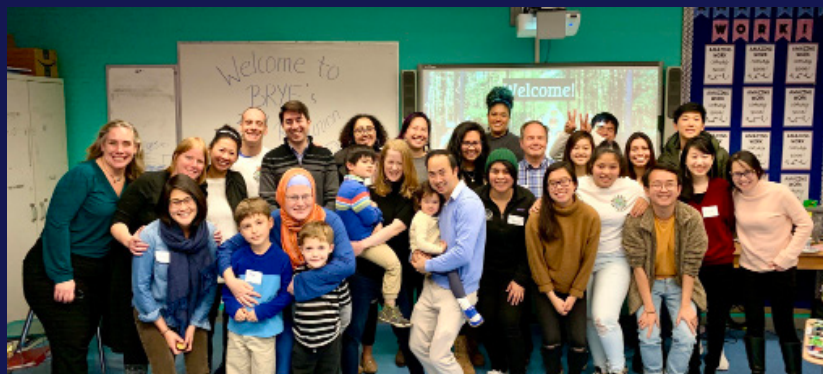
Alumni of PBHA's Boston Refugee Youth Enrichment (BRYE) program at the 2019 BRYE reunion in Fields Corner, Dorchester.