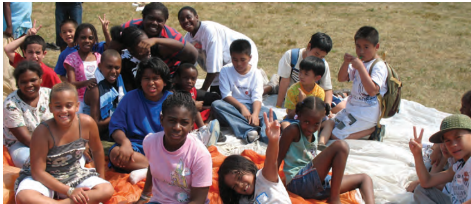
BRYE and Franklin I-O campers came together at Collaboration in Dorchester