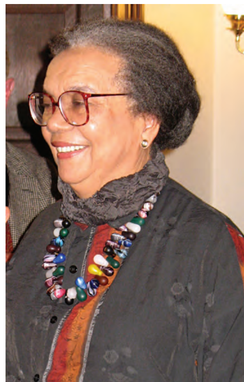
Marian Wright Edelman was an inspiring speaker for students and alumni alike.