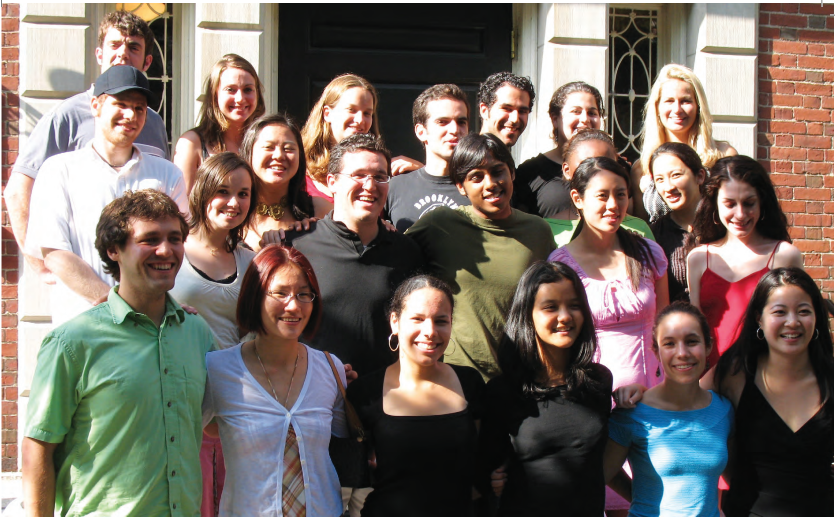
Graduating seniors pictured on the steps of Phillips Brooks House