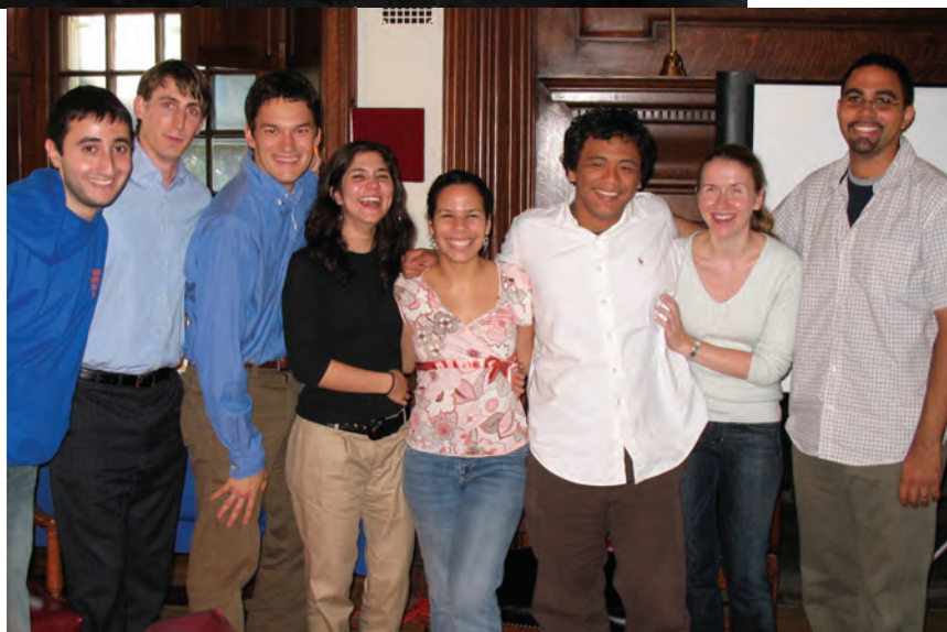
Celebrating Presidents, Vice Presidents & all PBHA Alumni!

students & communities partnering for social change