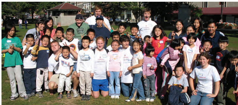
Volunteers on Boston Common with the children from Chinatown Afterschool