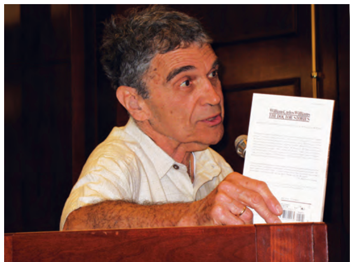
Robert Coles used examples from William Carlos Williams during his conversation with panelists. Former teaching assistants from his General Education Class “The Literature of Social Reflection” shared memories from his many years of teaching this class.