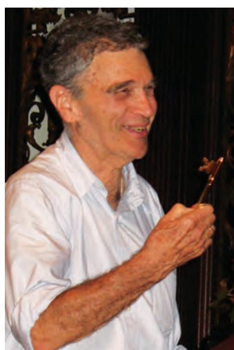
Robert Coles receives the key to the City of Cambridge.